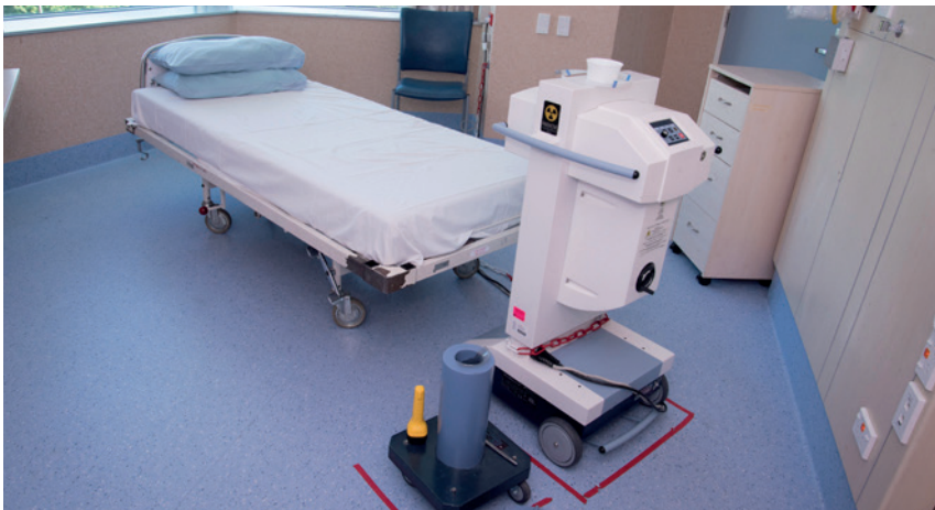
A room equipped with a machine that is used for high-dose-rate brachytherapy temporary source treatment.

E kore koe e noho iraruke whai muri i ia maimoatanga, nō reira, ehara i te mea me whai whakatūpatō motuhake koe ki te kainga.