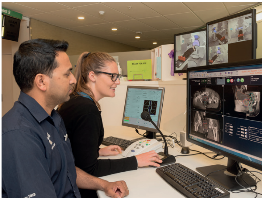
A radiation therapist will check your position before delivering your radiation treatment.